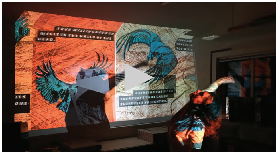
Kara Starkweather in On Heavy Lifting